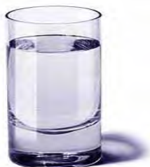
The source of NAS Oceana's drinking water is from Lake Gaston and Lake Wright and Western Branch Reservoirs.

Naval Facilities Engineering Command (NAVFAC) Mid-Atlantic Environmental 341-0482